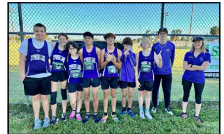
Pictured left to right.