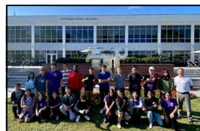
CLHS University of Tampa Trip 2023